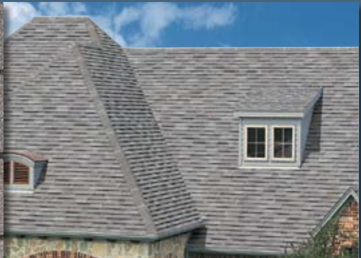
OLDE ENGLISH PEWTER